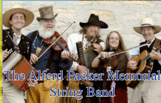
The Alferd Packer Memorial String Band

2006 SPBGMA Midwest Entertaining Group of the Year 7:00 P.M. • Tickets ONLY $7 also appearing - Bailed Green & Wired Tight